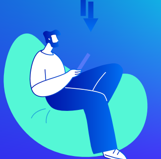
INTERNET (END) USER

Project of the Coordination Center for setting the interaction between Expert Organizations with Accredited Registrars to prevent illegal using of domain names in .RU and .RF. Expert organizations have the necessary knowledge and skills for detecting websites with illegal content, collecting and reporting incidents of phishing, unauthorized access to information systems and spreading malware. The Coordination Center granted these organizations the right to request Accredited Registrars to terminate domain name delegation for violating websites. According to TERMS and CONDOTIONS Registrars also have the right to terminate domain name delegation upon requests from the Expert Organizations.