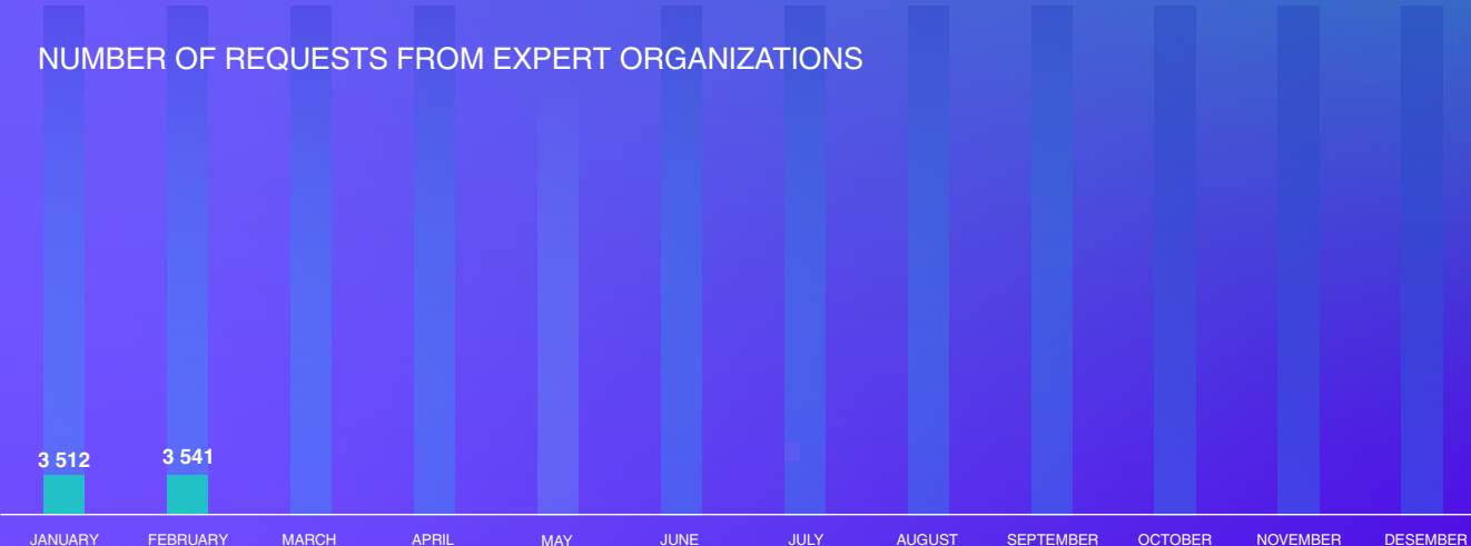
NUMBER OF REQUESTS FROM EXPERT ORGANIZATIONS