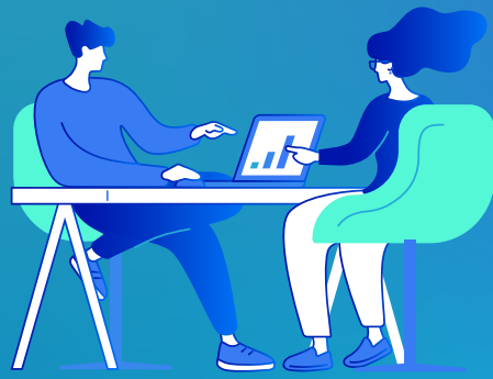
COORDINATION CENTER of TLD .RU and .RF